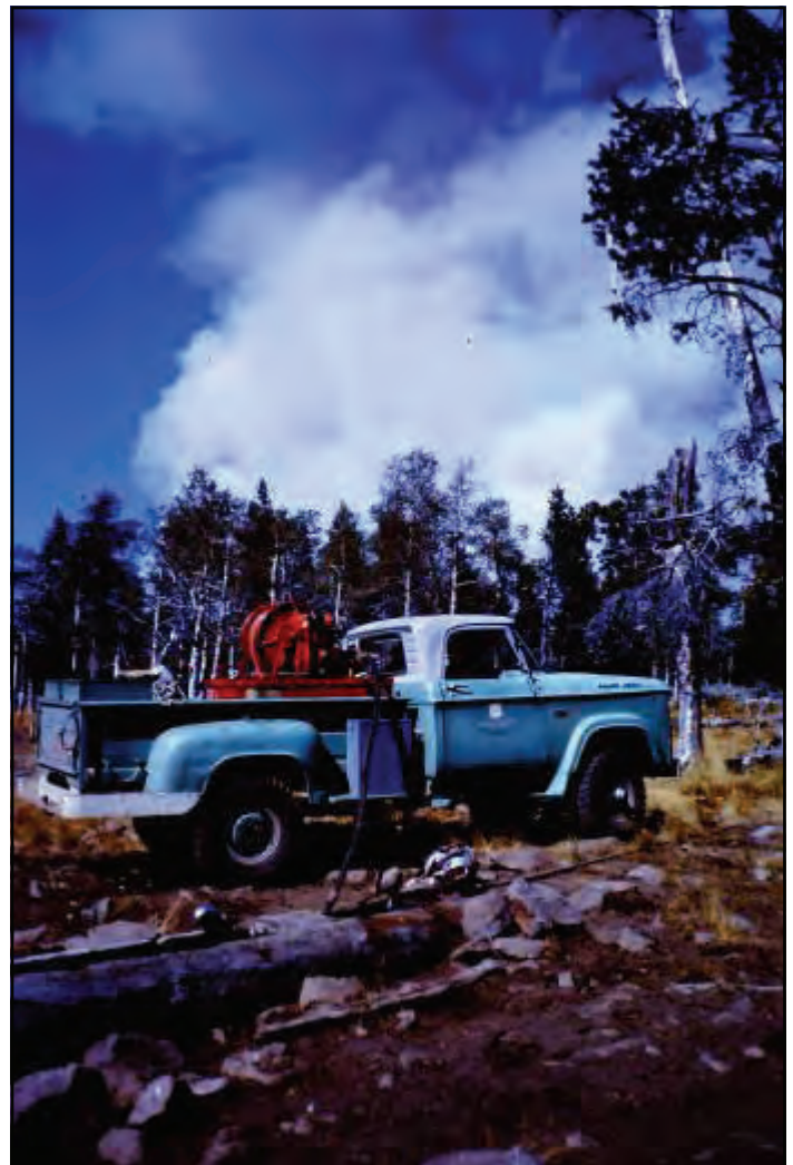
The smoke of the August 1966 Winter Rim Fire billowed above our Dodge Power Wagon.

We abandoned the radio in a cleft between two boulders and sprinted for a talus slope half a mile away. It was a close call for the hefty cat skinner who competed in our wildland hurdles. We helped him over a couple downed logs before, bathed in sweat, we joined his five buddies huddled against the half-acre