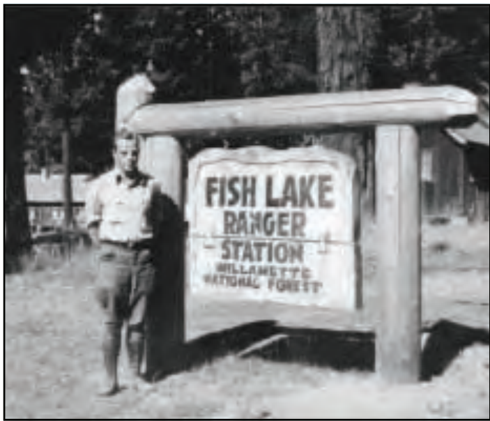
A U.S. Forest Service ranger stood next to the rustic Fish Lake Ranger Station sign in 1942.