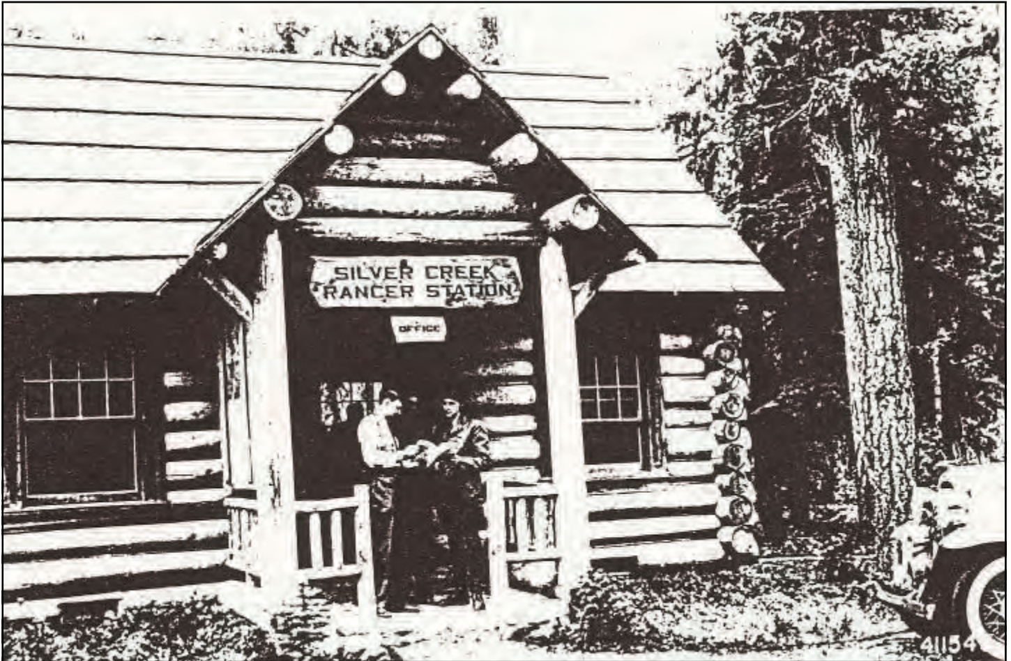
A officer provided information to a visitor at Silver Creek Ranger Station during the late 1930s.