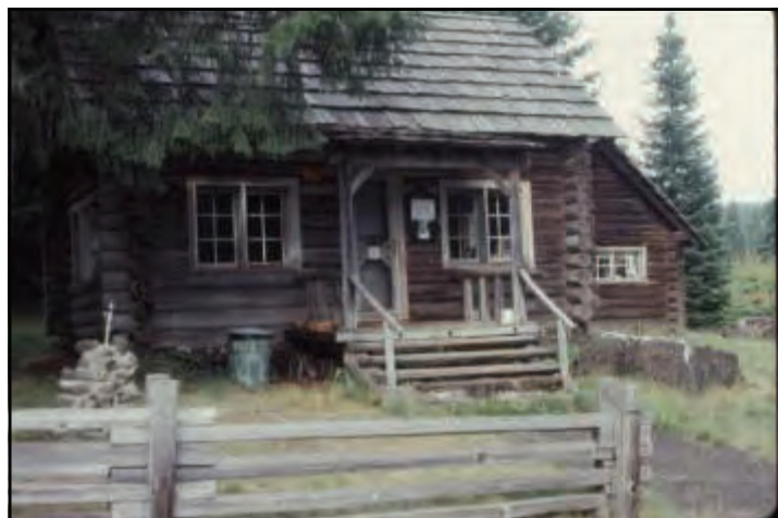
The 1921 dispatch cabin and 1924 commissary cabin in 1926 (above) when Fish Lake Ranger Station was Santiam National Forest summer field headquarters and in 1994 (below) when it was Fish Lake Guard Station before restoration work.

Historic Center [for] teaching wildland backcountry skills and the ecology of the Central Cascades,