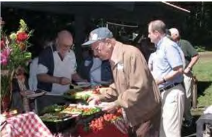
OldSmokey epicureans “chow down” at August 22 picnic.

The bottom line is your PNWFSA cannot continue as the premier Forest Service retiree organization it is without dedicated members filling these offices and program manager positions. It’s time for every able member to think about how he or she might best serve his fellow OldSmokeys—and then step up and shoulder part of the burden.