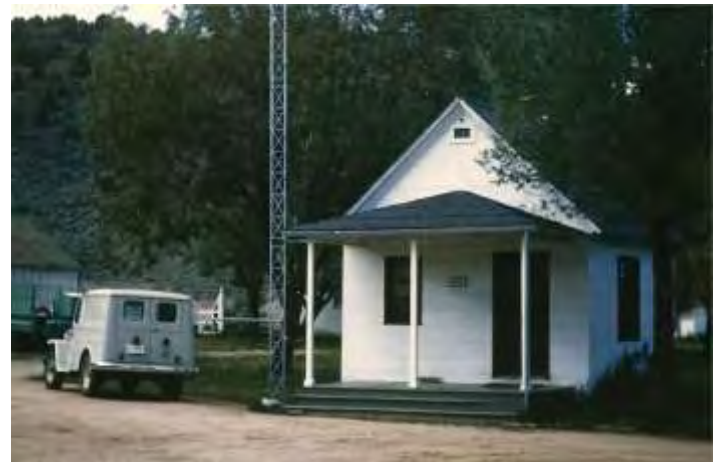
Bridgeport Ranger Station office building, Toiyabe National Forest, four miles northwest of Bridgeport, California, on U.S. Highway 395, 1933-1962.