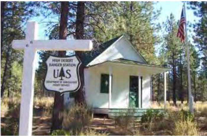
“High Desert Ranger Station” now being restored at the High Desert Museum south of Bend, Oregon.