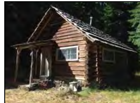
Extensive measures were necessary to rid Commissary Cabin at historic Fish Lake Ranger Station of bat guano. Read below.