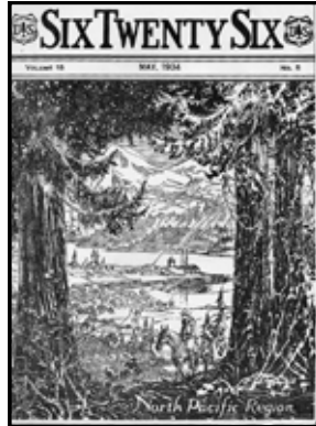
The cover of the May 1934 Six Twenty Six depicted a forest ranger riding through the beautiful, productive North Pacific Region ranger district he managed.

We need more originality in thought, speech, and action; we are too sheep-minded. Someone coins a phrase or word combination, a good one, appropriate and illuminating—and we “work it to death.” For instance, “sustained yield”, “single use